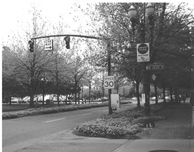
Figure 1. Livable streetscape treatments: urban amenities or roadside hazards?