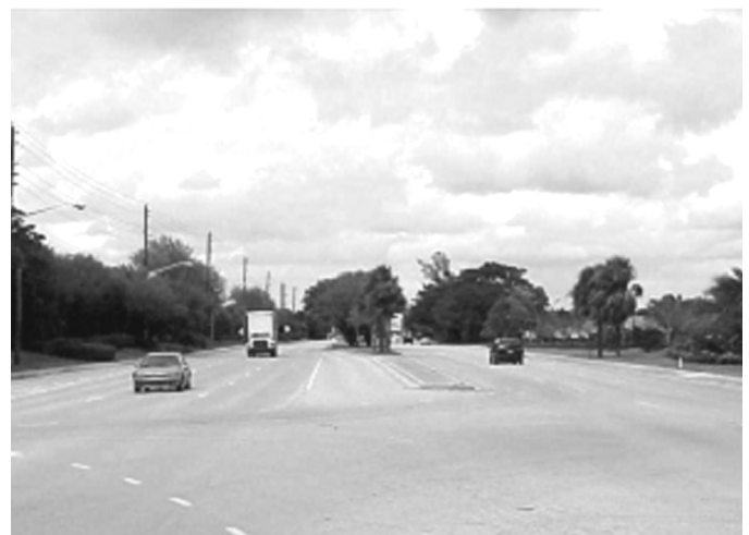
Figure 3. Three urban minor arterials.